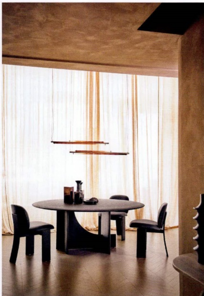
GALLOTTI&RADICE Via Cavallotti 16 and Via Mascheroni 15, Milano

Since 2018, the Gallotti&Radice flagship store, created in partnership with Salvioni Design Solutions in the heart of the Durini Design District, has become a center for creative experiments driven by the designers who work with the company and interpret its style.